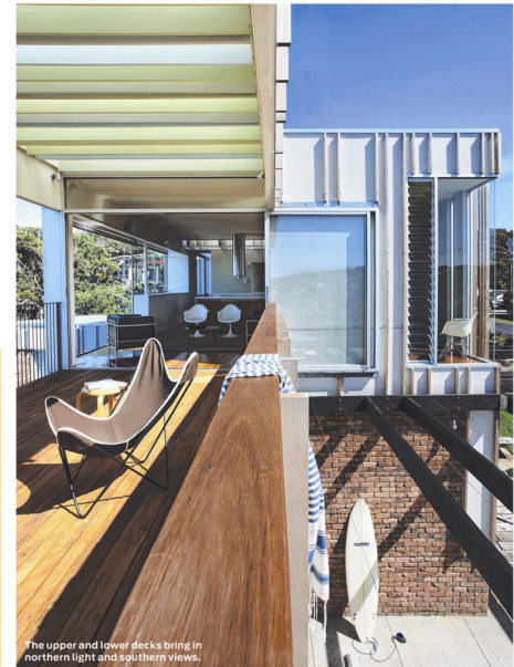
The upper and lower decks bring in northern light and southern views.

Balancing the need to maximise the view to the south while also attracting northern light and cross breezes was a challenge during the design stage. Architect James Fraser says: "The home sits on the saddle of the hill and it was really about developing the views to the south and reinforcing that through the design. The upper and lower decks are poised out there almost free of the building, creating this viewing platform which gets the northern light in. On the northern side we've installed glass louvres because they pick up those northeast breezes and are an efficient way of ventilating a space. The northern windows are full height vertical slit windows and are louvred."