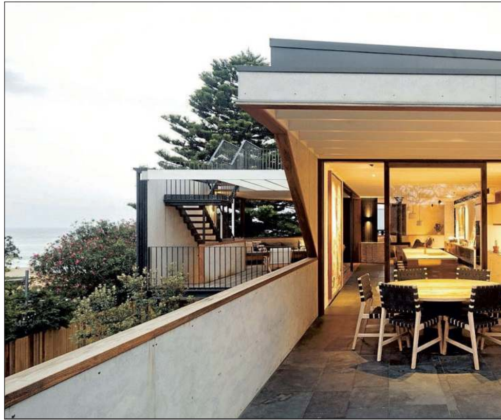
IMPRESSIVE OUTCOME: Paterson Buildings' award-winning entry is located on a sub-divided block at McMahers Beach with magnificent ocean views.

"It isn't hard to see and feel the high level of skill and craftsmanship that has been