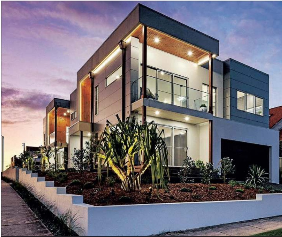
OUTSTANDING: Yarrum Designer Homes award-winning entry located at Merewether, reflects the commitment to excellence the company has become synonymous with.