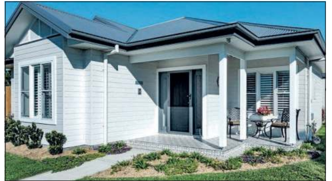
WORKING WITH YOU: The team at Yarrum has the knowledge and experience to deliver quality uniquely designed homes to suit any site, budget, or lifestyle.

race in one of the duplexes to ensure both homes offered panoramic ocean views, to the way the building works with the slope on the site to provide a comfortable and visually stunning home.