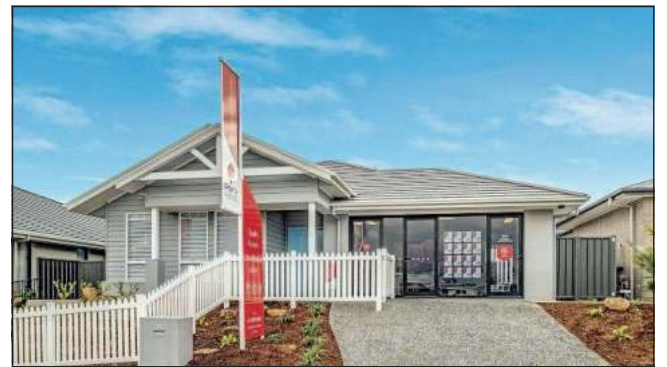
WINNING LOOK: Perry Homes' winning entry, the single storey Azure 27 display home, is available for viewing at Cameron Grove Estate.

Established in Northern New South Wales in 1993, Perry Homes has forged its reputation as one of