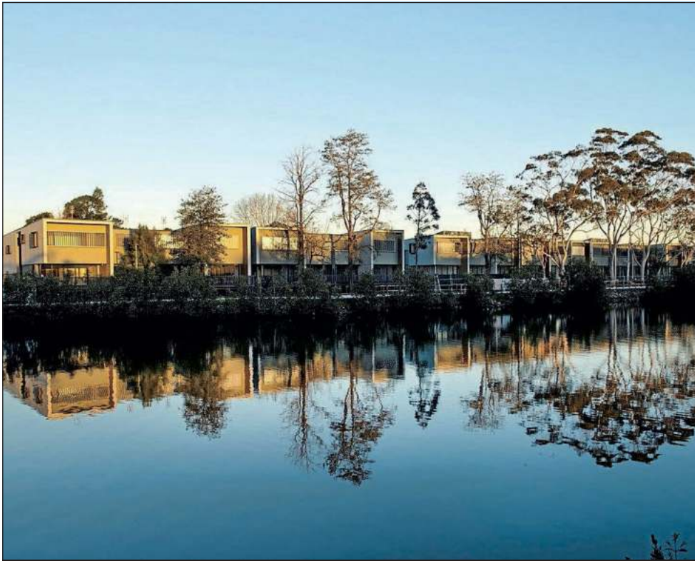
WINNING FORM: Mavid prides itself on quality workmanship throughout all of its construction projects including this entry which took out the prize in the 2020 Townhouse/Villa Development over 5 Dwellings.

"The acknowledgement is a direct credit to our wonderful staff, suppliers, subcontractors and clients who we have worked tirelessly to create strong relation-