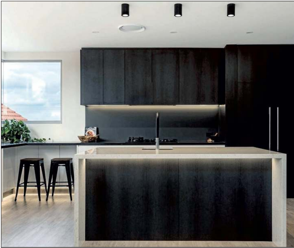
CUSTOM CLASS: The winning kitchen from Kitchens for Living.

Kitchens for Living has been a keen award contender and winner for the last 10 years and being recognised again is not just about another plaque for the wall, it is about the industry recognition that it is continuing to evolve and grow as a company which is consistently staying relevant in the market.