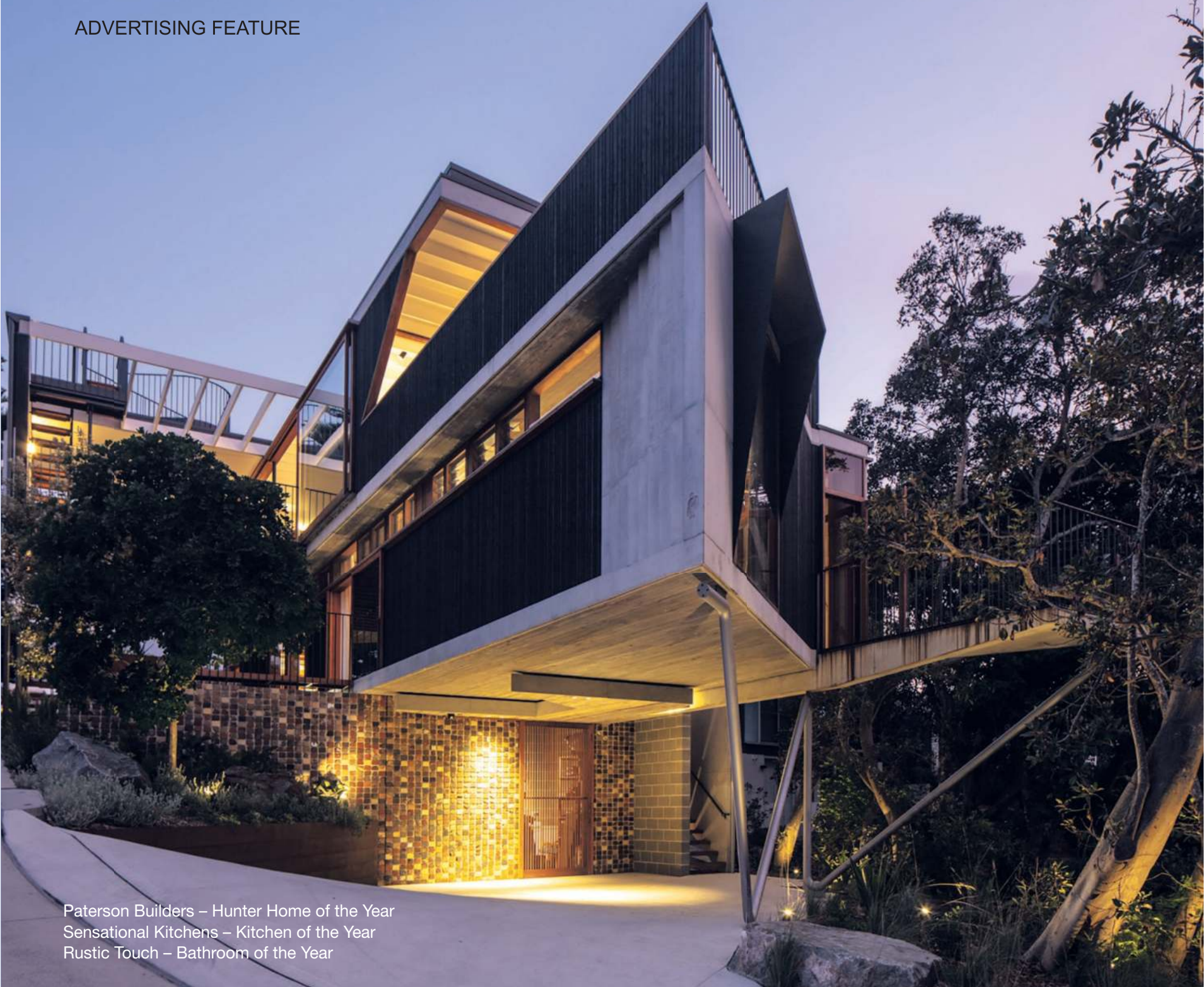
Paterson Builders – Hunter Home of the Year Sensational Kitchens – Kitchen of the Year Rustic Touch – Bathroom of the Year