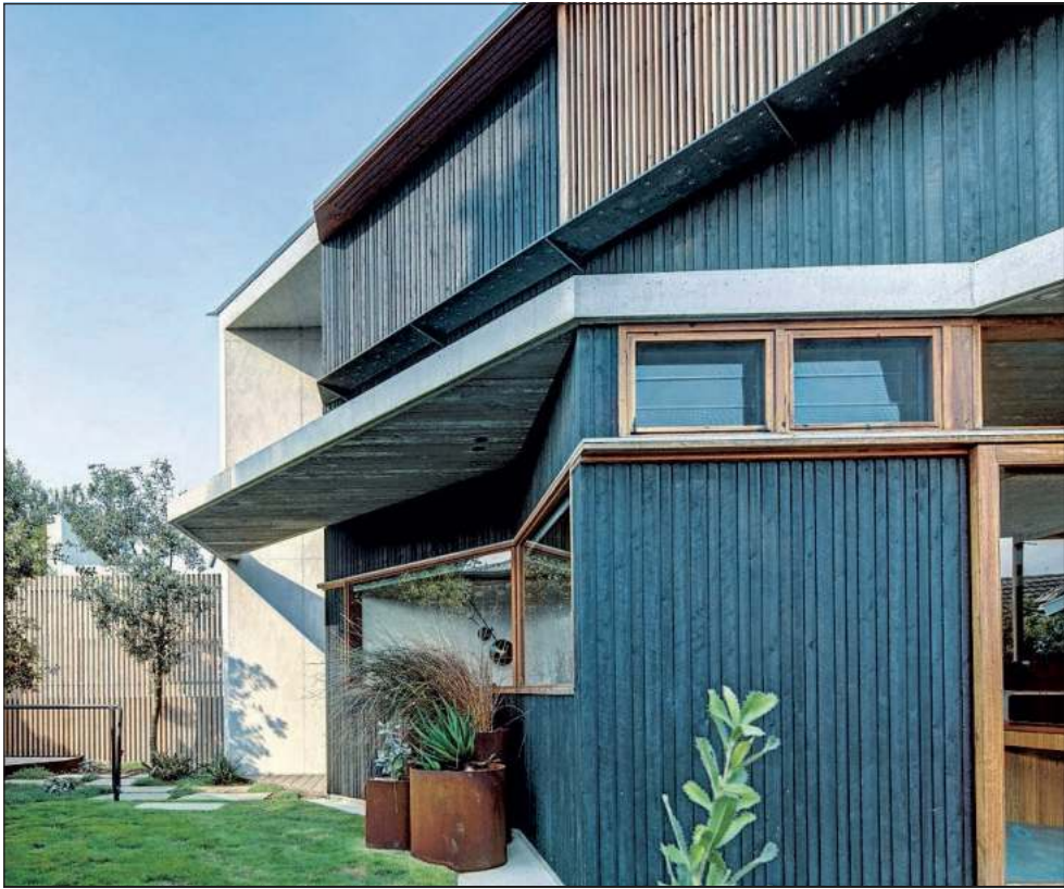
ATTRACTIVE PACKAGE: Paterson Builders was named 2020 HIA-CSR Hunter Home of the Year and Custom Built Home of the Year winner.

Against strong competition the judges said "the house has an amazing street appeal and from here your senses start to be stimulated by every aspect of this uniquely designed project".